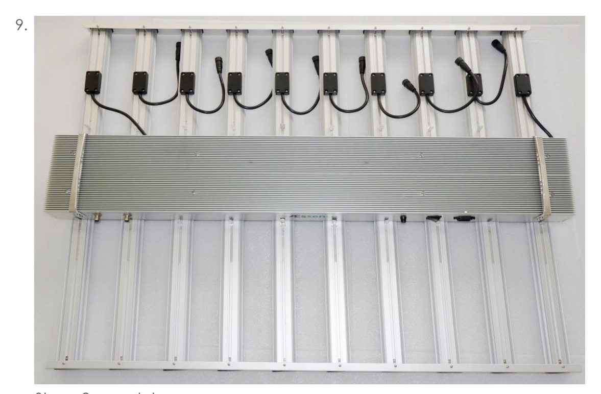
Stage 2 complete