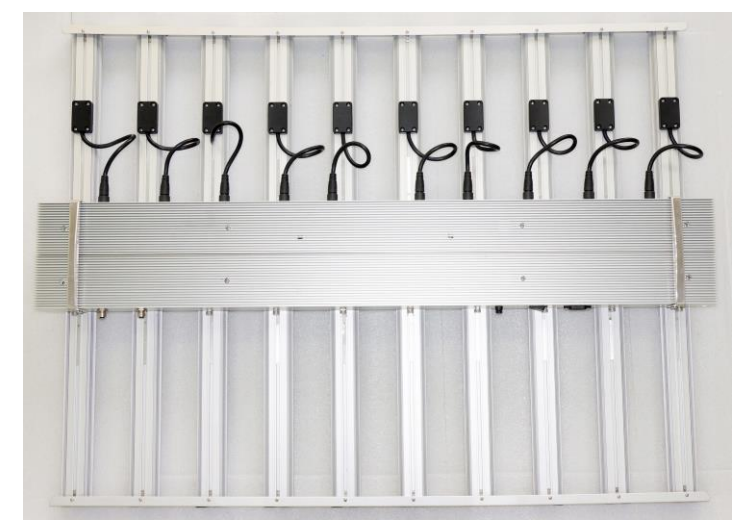
Fully assembled grow light