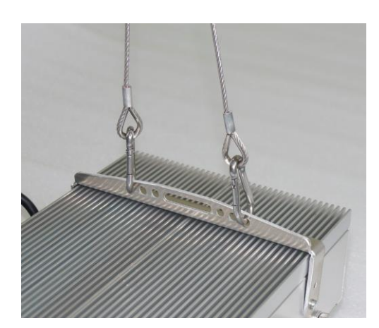
AEpic grow light hanging over grow tray

Only connect the AEpic grow light to power sources with the correct voltage (100-240 V AC, 50-60 Hz) using one of the provided power cords. Protect the power cords from being damaged in any way. Only connect the AEpic grow light to an electrical outlet of appropriate type and rating. Be particularly cautious when routing the power cords.