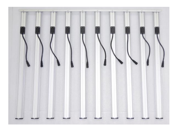
Stage 1 complete